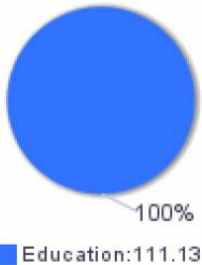
Table1: MSYs by Focus Areas