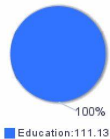
Table 1: MSYs by Focus Areas